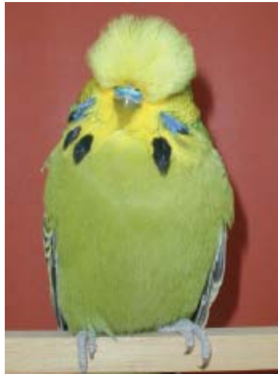
Best in Show at the 2002 NGC-DBS (Dutch National) Grey Green cock bred by Backx, Cuyten & Maas